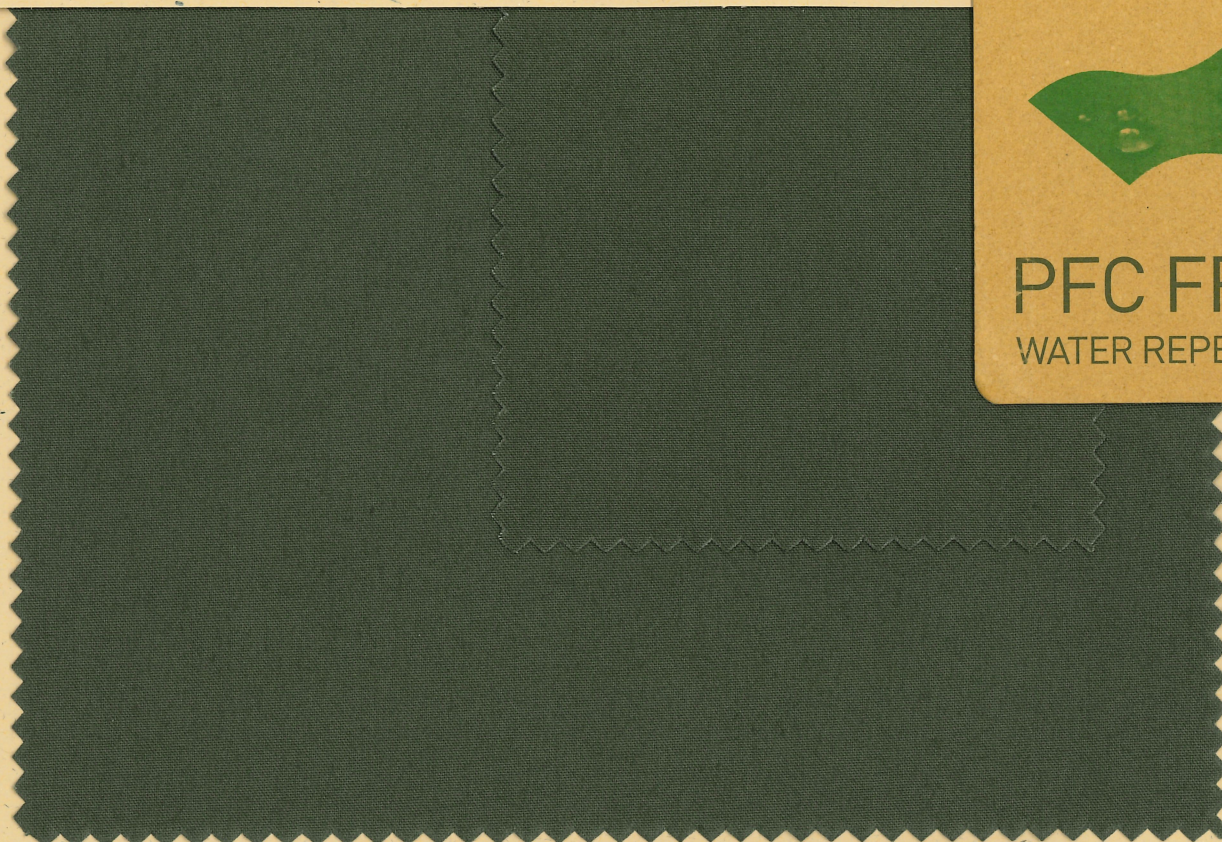
C/#00 . PFD