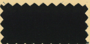
C/#99 . BLACK