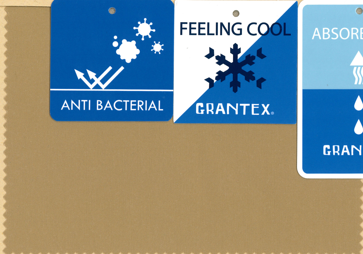
C/#120: FOX NO-WASH